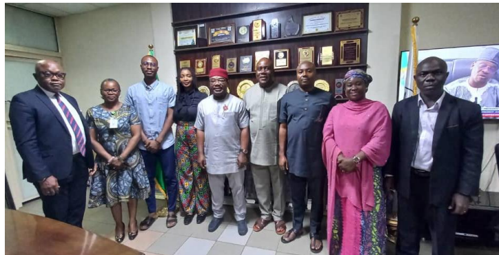
Members of the Nigeria ICWG met with the Executive Secretary of the National Human Rights Commission

The Nigeria In-Country Working Group has maintained quarterly meetings in Abuja. These meetings serve as a crucial platform for strategizing on program initiatives and engagements, as well as for raising awareness about the Voluntary Principles. The ICWG and its members have actively conducted training sessions focusing on security and human rights, which include sensitization efforts aimed at diverse stakeholders such as companies, public security providers, and private security providers. The ICWG has also undertaken outreach to host communities, particularly concerning mining activities and human rights issues. These communities have been empowered through education on the Voluntary Principles and responsible mining practices.