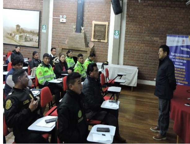
Training on security and human rights for police personnel and journalists in Cusco, Peru