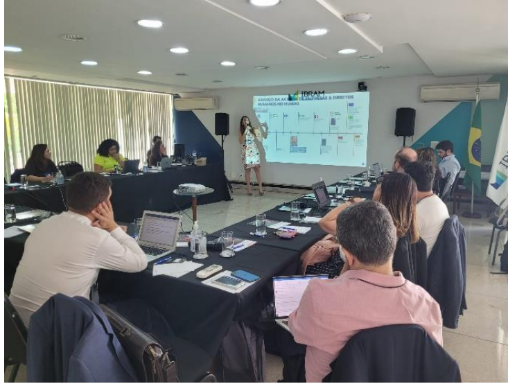
The Brazil ICWG met in in Brasília in November 2023