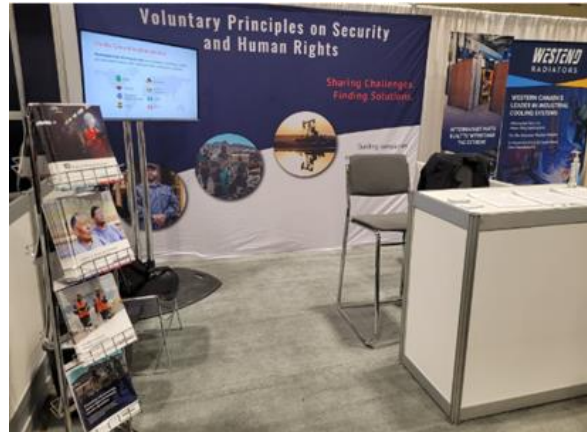
The VPI Secretariat engaged with visitors at the booth. Visitors appreciated hard copies of VPI resources