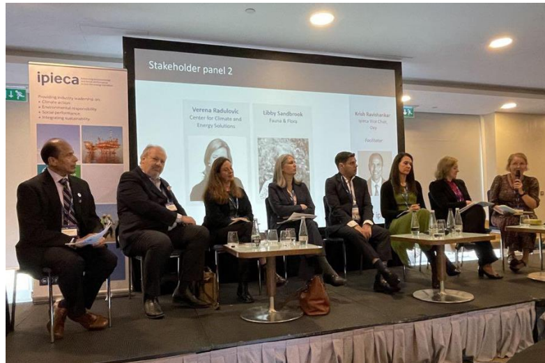
Ipieca Week 2024 Stakeholder Panel