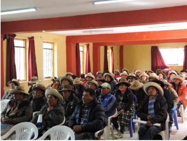
Presentation on security and human rights for leaders of the rural communities of the district of Colquamarca, Cusco, Peru