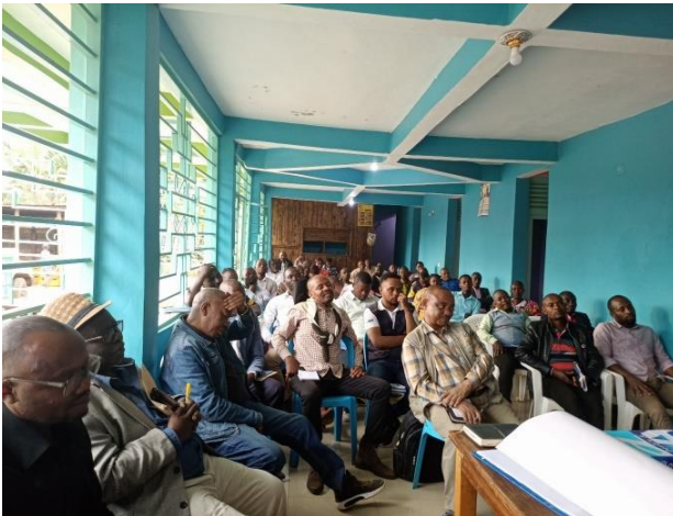
Meeting in Luhihi (South Kivu), DRC, facilitated by the ICWG to promote peaceful artisanal mining in the area

The VPI Partner ICWGs, formed by a variety of stakeholders committed to security and human rights best practices, both Members and non-members of the VPI, carried out various meetings and training sessions in 2023-2024 to raise awareness and promotion of the VPSHR.