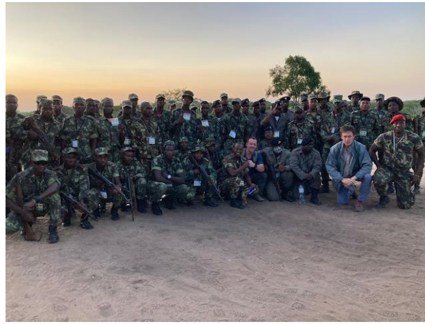
Training of public security providers in Mozambique