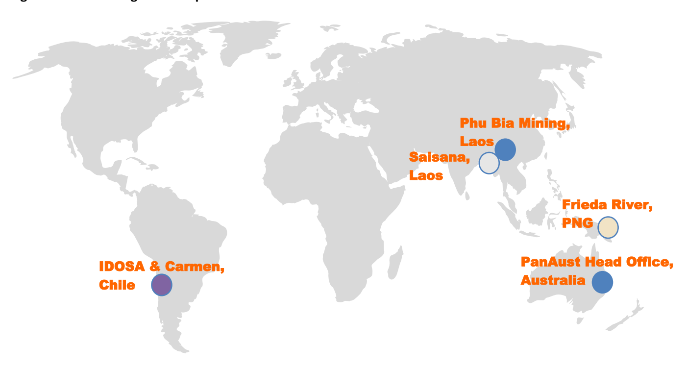
Figure 1: PanAust's global footprint

Within this document, the details of country implementation associated with the VPs are provided primarily for Laos as the Company's operations in Laos present the organisation's current material security and human rights challenges. The Laos operations continue to be the only location where proprietary, private and/or public security personnel regularly support the Company's on the ground activities C9 .