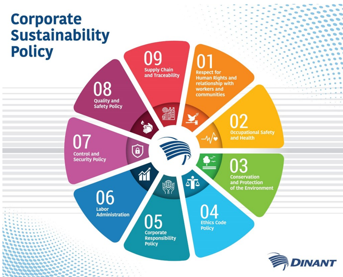
Above: The Corporate Sustainability Policy

The Company has closely followed the evolution of the VPs and monitored the changes and evolving guidance to ensure it remains compliant with the spirit, as well as the letter, of the Governance Rules. In addition, Dinant is reprinting handout flyers regarding the VPs for each major worksite. This information is provided in Spanish and English. The flyers are also provided to the local communities during meetings with the Social Team members.