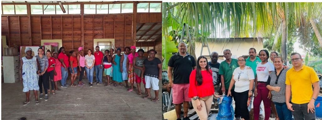
Community Engagement Program led by members of the Social Team

Over a decade ago, Dinant realized that its informal community engagement was not as effective as it could be, and that a more robust and open communication with them was necessary. The Company wanted to have direct relationships with all the communities near their sites, particularly the Indigenous communities. Accordingly, Dinant established a program to allow all the communities to have a two-sided communication pursuant to which community members could easily reach out to the Company. The Grievance Resolution Mechanism was implemented, and has significantly improved communication, allowing the Company to engage with all communities, including vulnerable groups, while also creating initiatives to mitigate any possible negative effects its operations may cause. This has allowed the communities to express their concerns and discuss them with the Social Team members at each site. The implementation of a formal social engagement program has enabled Dinant to find a simple and reliable way in which community members can reach out and communicate with the Company and find constructive and sustainable solutions that create a safe and secure environment for all parties.